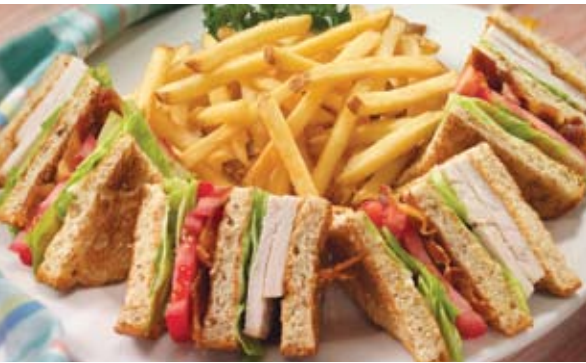
Triple Decker Club

Served with choice of fries, side salad, cup of soup or fresh fruit (excludes Open-Face Sandwiches).