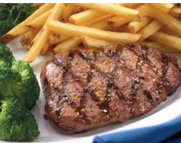
7 oz. Top Sirloin Steak