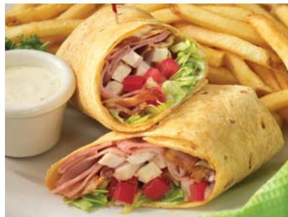
Ham & Turkey BLT

We proudly serve Applewood smoked bacon and hand-carve our own Butterball® turkey breast.