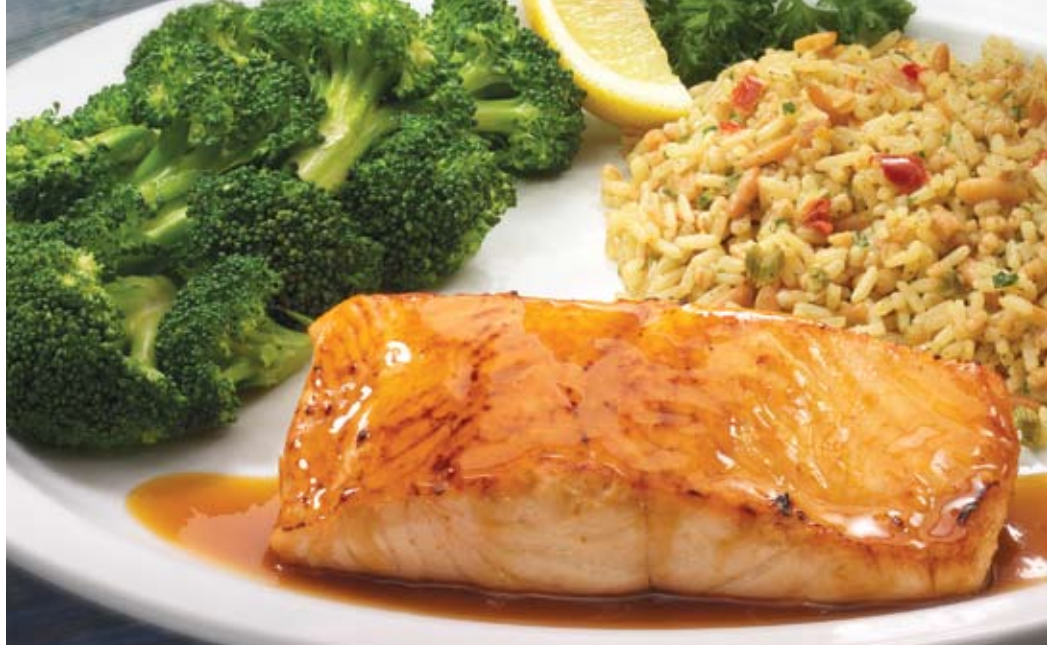
Apricot Teriyaki Grilled Salmon