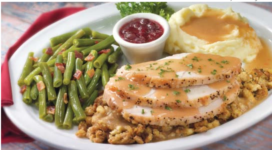
Butterball® Turkey & Dressing

*NOTICE: Consuming raw or undercooked meats, poultry, seafood, shellfish or eggs may increase your risk of foodborne illness.