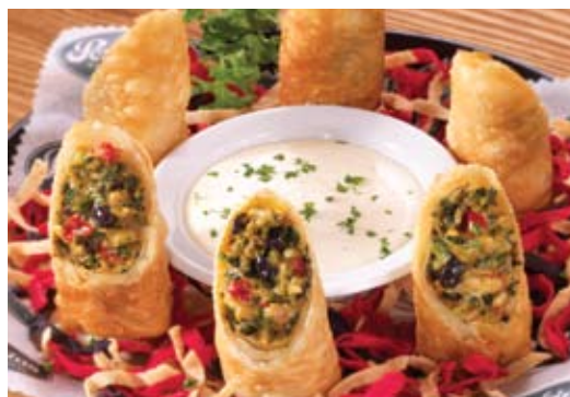
Santa Fe Mini Chimi's