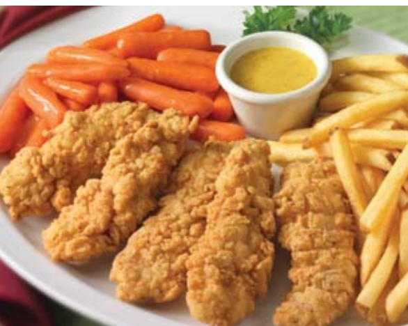
Chicken Crisp Platter