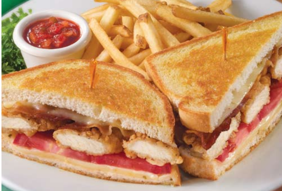
Chicken Tender Melt