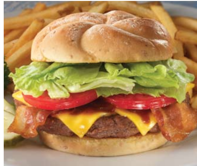
BBQ Bacon Supreme Burger

Choice of American, Swiss or Pepper Jack cheese, served with lettuce and tomato.