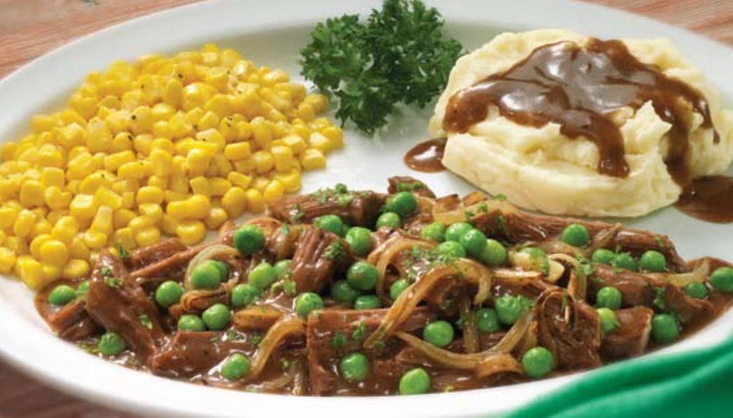
Homestyle Pot Roast