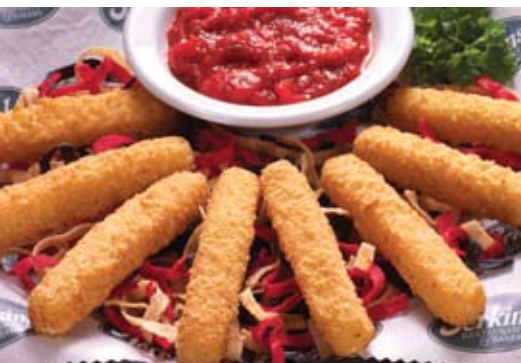
Zesty Mozzarella Sticks

A generous portion, lightly battered and fried to crispy perfection.