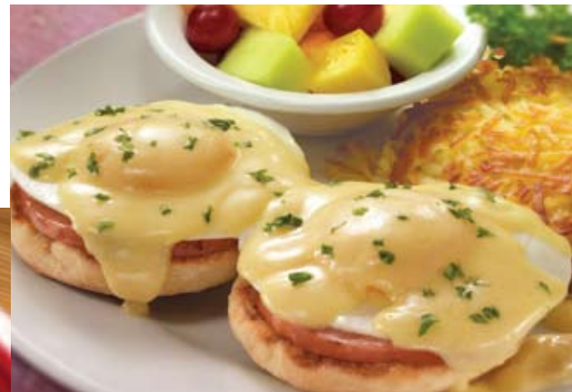
Classic Eggs Benedict

Our classic Eggs Benedict with smoked bacon and Canadian bacon, topped with rich hollandaise sauce and crumbled bacon bits.