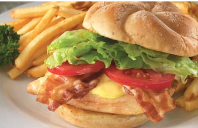
Bacon 'n Honey Mustard Chicken

Bacon, American cheese, lettuce, tomato and zesty BBQ sauce, all on a grilled chicken breast.