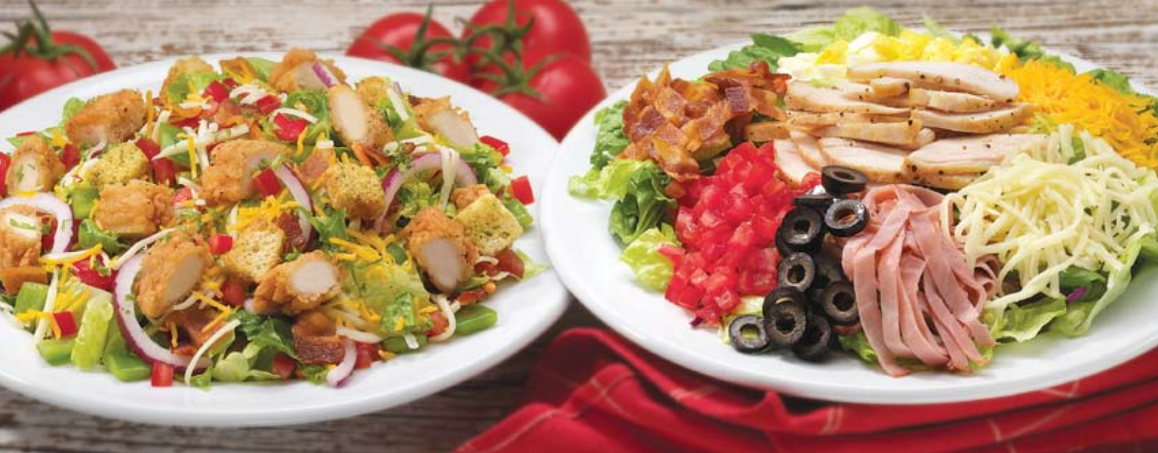
Honey Mustard Chicken Crunch and Chef Deluxe