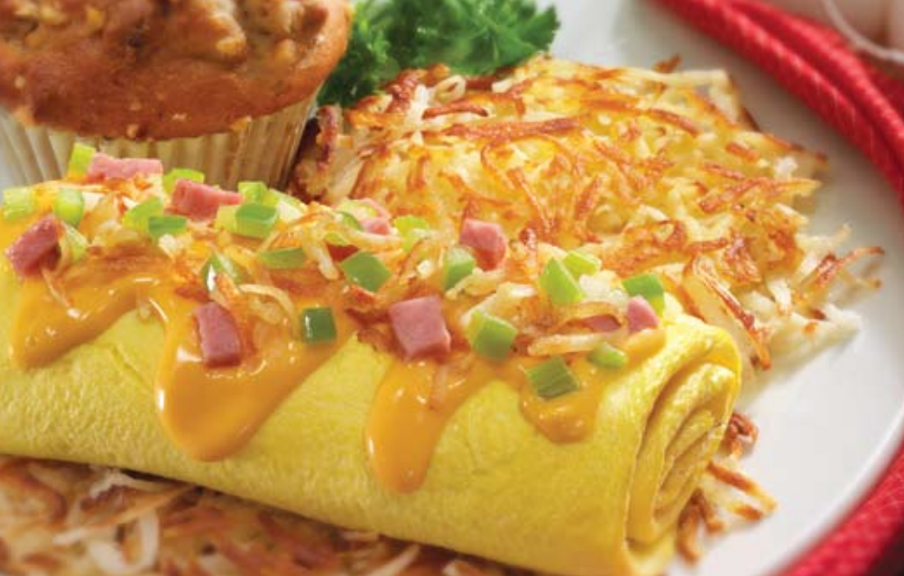
Granny's Country Omelette™