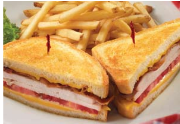
Country Club Melt

Butterball® turkey, bacon, tomato, American cheese and Thousand Island dressing on sourdough bread.