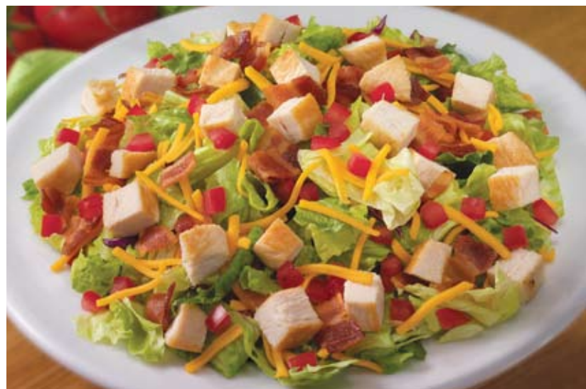
BLT Chicken Breast

Spicy blackened chicken, black olives, red onions, tomatoes, red and green peppers, Monterey Jack and cheddar cheeses. Served with Ranch dressing and crunchy confetti straws in our crispy-fried tomato tortilla shell.