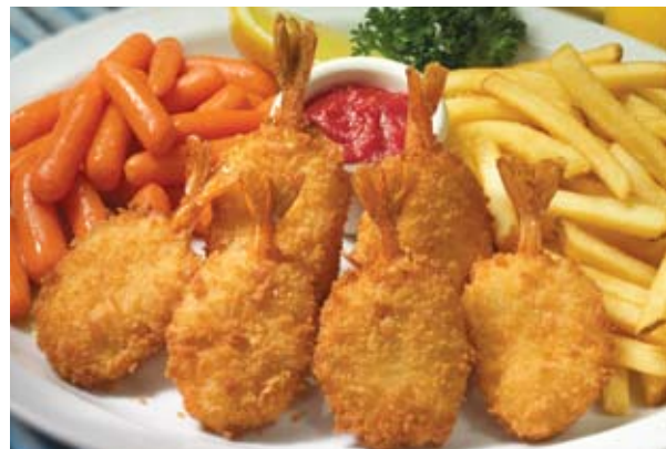
Jumbo Shrimp Dinner

A generous portion of jumbo butterfly shrimp, breaded and deep-fried. Served with zesty cocktail sauce.