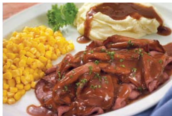
Roast Beef Dinner

Tender slices of roast beef, served with hearty beef gravy.