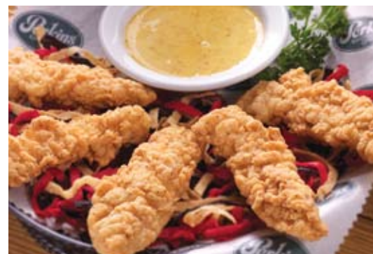
Chicken Tender Crisps