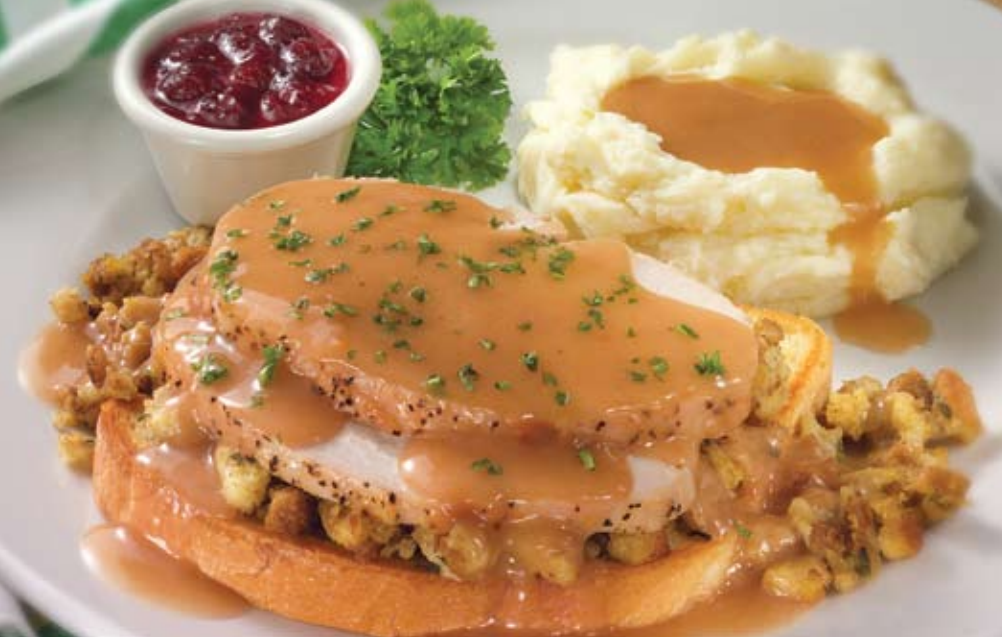
Open-Face Turkey Sandwich