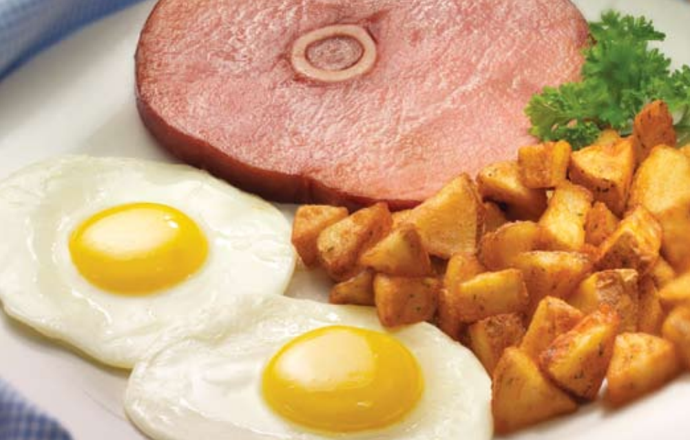
Smoked Ham & Eggs