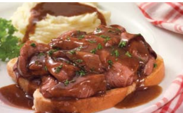
Open-Face Roast Beef

Hearty roast beef on grilled sourdough bread, topped with brown gravy and served with mashed potatoes and gravy.